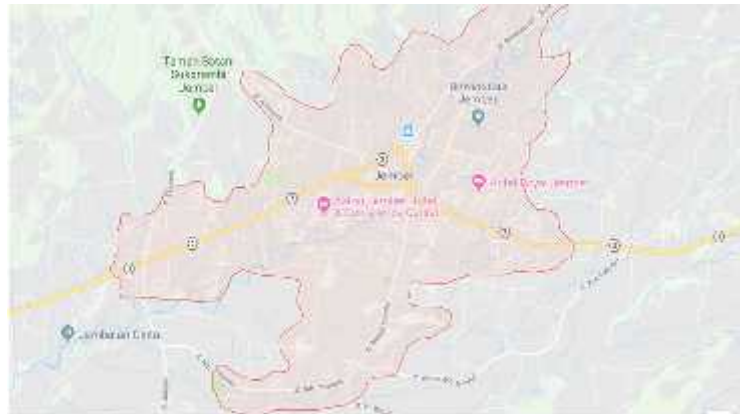
Picture 1. Jember

government to plan a prevention or treatment of diseases in Jember Regency. The developed system is shown by Figure 1.