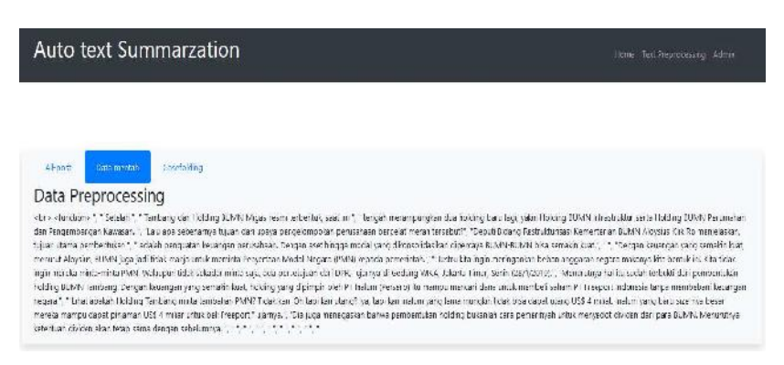
Figure 7. Viewing selected data

The next process is case folding. At this stage, in addition to changing to the lowercase form, also carried out the stage of cleansing the text of punctuation that is not necessary or not related to news content. This punctuation is usually the result of a web scraper, which still leaves the html code in the search results.