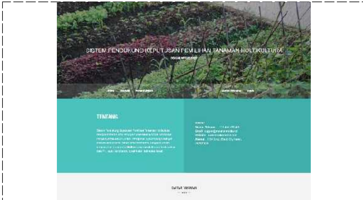
Figure 1. About Application

The application consists of two users, namely users and amen. The user page that will get information about horticulture plants, growing requirements and can analyze the selection of horticulture plants suitable for planting based on PH, temperature, rainfall and soil highlands. Admin page that will input, edit and delete information about horticulture plants and perform knowledge representation figure 1 – 4: