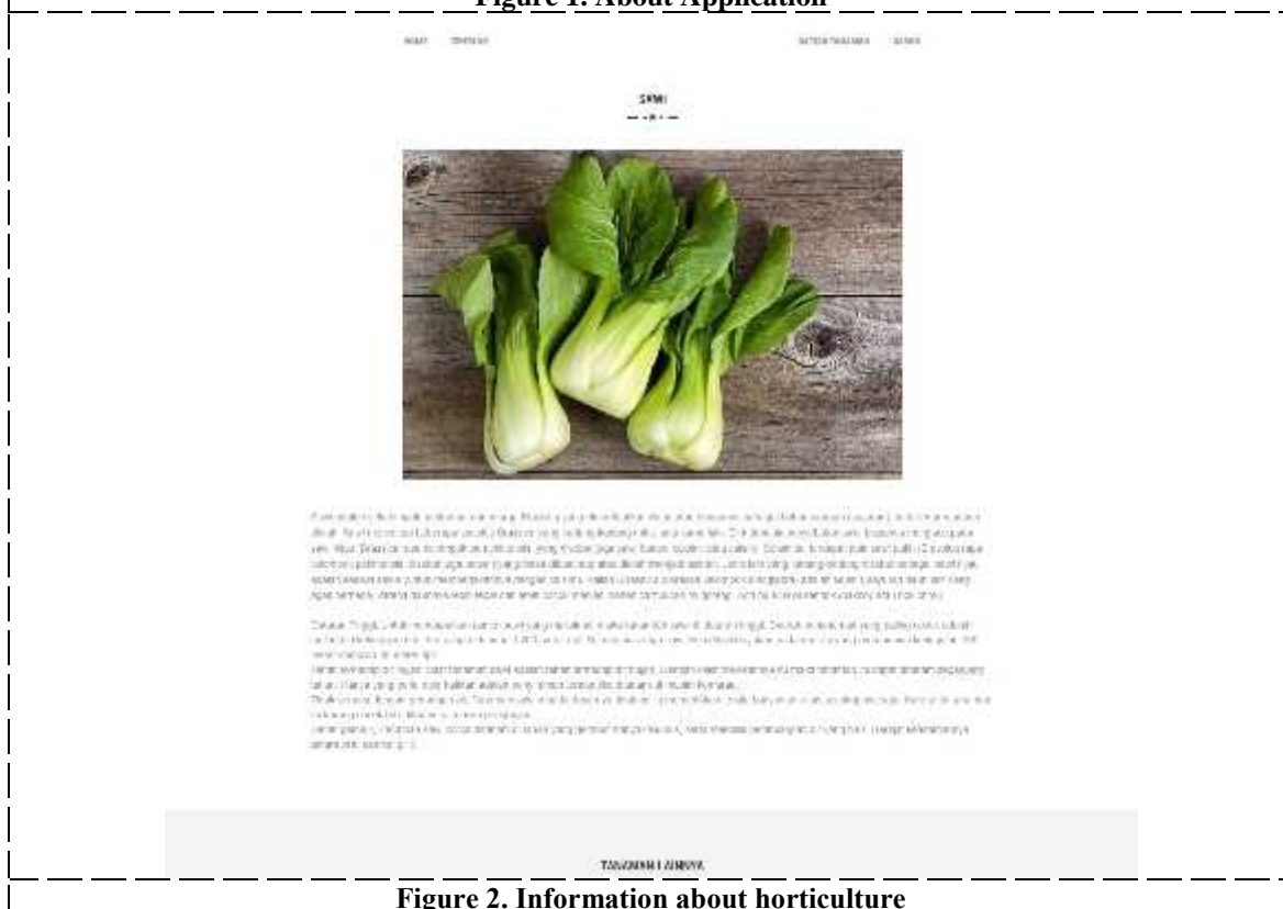
Figure 2. Information about horticulture