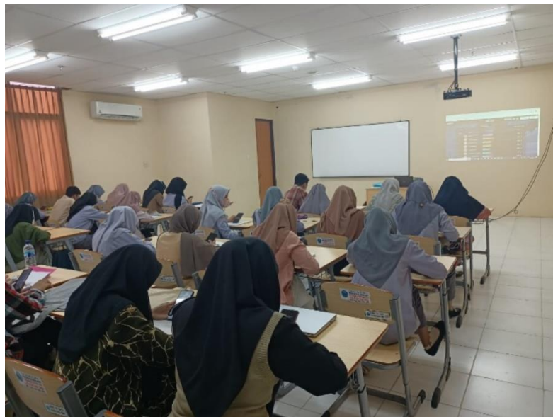
Figure 1. Live quiz in the classroom

For the supporting tools, the teachers only need a laptop, projector, audio-sound, and an internet connection. Apparently, there are various obstacles that are expected to happen such as not being familiar with Quizizz features and the usage of internet data account. Nevertheless, in teaching and learning activities in the campus environment, the availability of classroom areas with the availability of internet connection (wifi) is quite common and accessible.