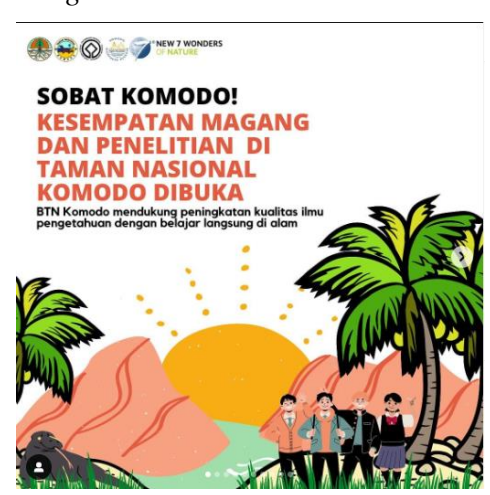
Image 8 displays verbal texts containing information about opportunities for viewers to have internship and research programs in Taman Nasional Komodo in order to improve the quality of science through direct learning in nature. In addition, there are some logos of institutions and a logo of G20. The verbal texts were completed with the picture of 4 people standing on the outdoor showing grass, sunshine, beach, mountains, and coconut trees. The most dominant part of the image is the verbal texts written with big, bold, red, and uppercase letters.