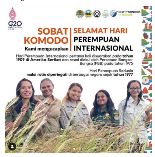
Image 6 shows the photo of 5 women standing behind the grass. The women are wearing different uniforms. There is also verbal texts celebrating "International Women's Day" and containing information about the history of the international women's day. It is also completed with some logos of institutions and a logo of G20. The symbolic attributes of this image are 5 women who become representatives or symbol of all women in the world.